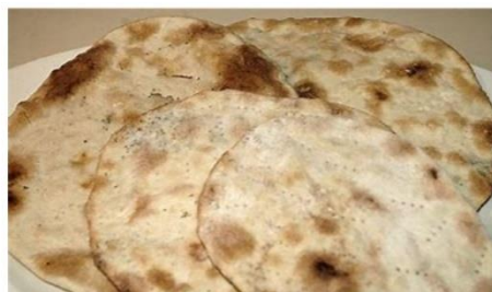
Day 2: Unleavened Bread

42 And now when the evening had come / sometime between 4- and 5 o'clock, because it was the preparation, that is, the day before the Sabbath / the 2 nd great Day of the Lord that Moses told us about; the Feast of Unleavened Bread , when bread, the staple of all mankind... is wrapped in a napkin and hid out of sight. Paul says, the 7 Days are shadows of things that would come , they only find meaning in something the Messiah does,