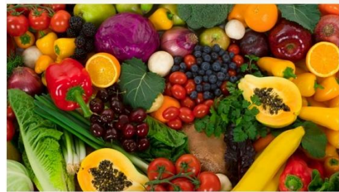
Day 3: Firstfruits