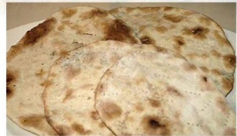
Day 2: Unleavened Bread