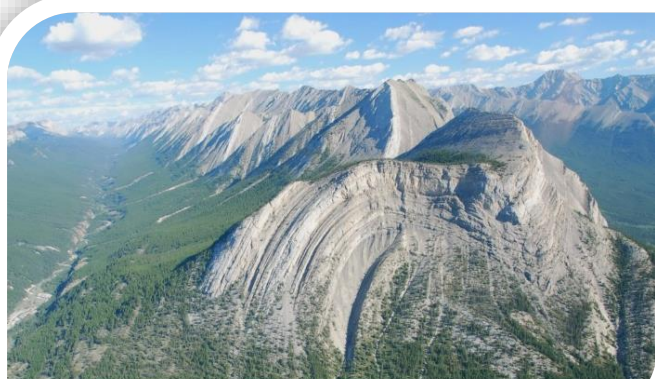
Folded rocks indicate global catastrophe; only created suddenly in water; evidence of Noah's flood 1

3 And the LORD said, My spirit will not always strive with adam, for that he also is flesh: yet his days will be a hundred-twenty (120) years.