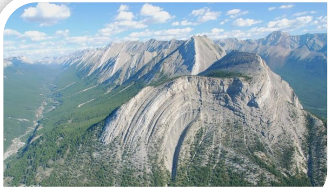
Folded rocks indicate global catastrophe; only created suddenly in water; evidence of Noah's floor'