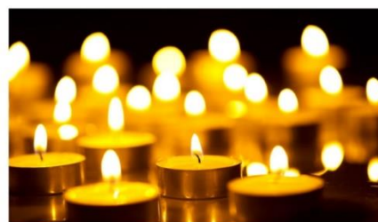
Day 4: Pentecost

when the day of Pentecost was fully come / the word is: sumpleroo ; used 3 times in the New Testament: 1. when the boat was filled up with water and the disciples were in jeopardy; 2. when the time in the life of Jesus had fully come... and He set his face to go to Jerusalem; and 3, here: